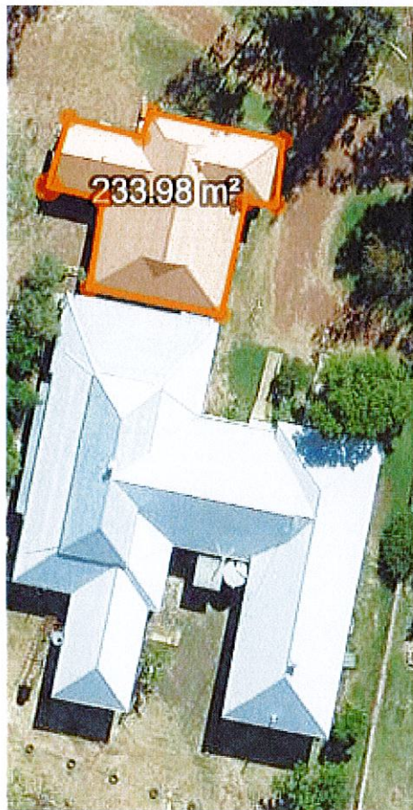
1 bedroom unit